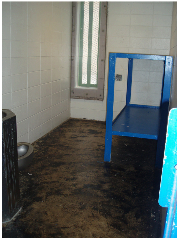
Segregation cell at Howard R. Young Correctional Institution