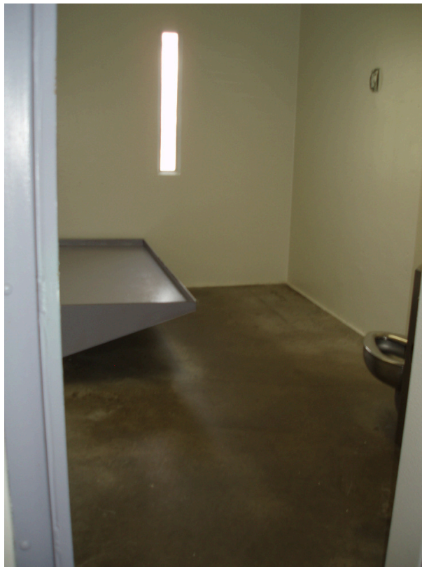
Cell in Security Housing Unit (SHU) at James T. Vaughn Correctional Center

Any individual on AS for longer than 7 days is reviewed through Prioritized Classification by the Institutional Release Classification Board (IRCB). The decisions of the IRCB can be vetoed by the warden, BOP chief or Commissioner. Their decisions are not appealable. Other reclassification meetings by the Initial Classification Board and Multidisciplinary Team require that an individual be interviewed, that records be reviewed, and that staff are available to assist the person in the process. The IRCB process that reviews placements in AS does not provide these protections.