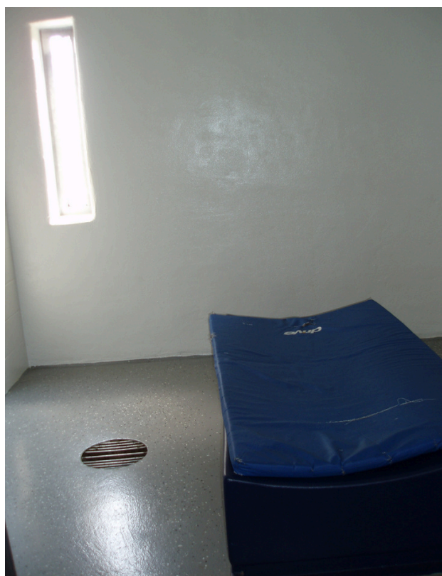
A PCO cell at James T. Vaughn Correctional Center

The level of monitoring and whether individuals are able to wear their regular DDOC-issued uniforms while on PCO depends on PCO Tier status, which is based on the assessed level of risk for self-harm. Individuals placed on PCO Tier I, who are assessed to present a more acute risk of suicide, are under constant observation by staff and are only permitted to wear a suicide smock. Individuals placed on