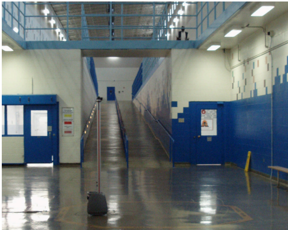
Hallway at Howard R. Young Correctional Institution

meaningful vocational activities including CNA training. BWCI should be considered a model. Staff at HRYCI indicated that most of the patients on the Transitional Unit in that facility could benefit from an RTU setting.