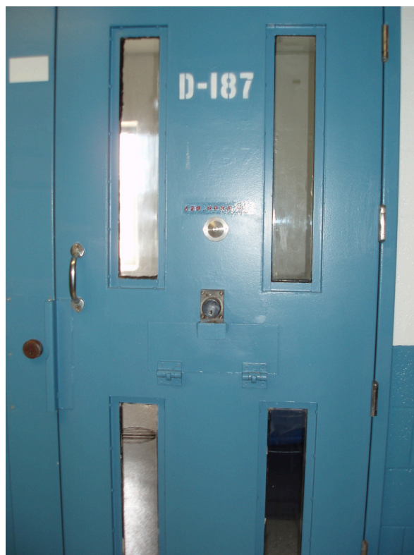
Door of locked PCO cell at James T. Vaughn Correctional Center